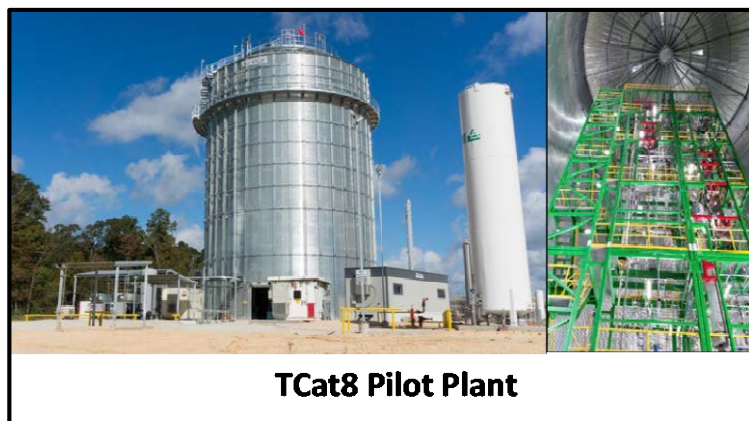
TCat8 Pilot Plant

Our large scale TCat8 test unit located outside of Houston, Texas, (shown below) will demonstrate and provide scale-up bases for commercial design in Anellotech's ongoing plastics conversion development program.