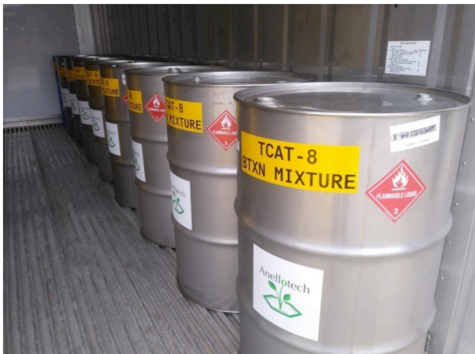
Bio-based BTX aromatics made with Bio-TCat™ technology, ready for purification